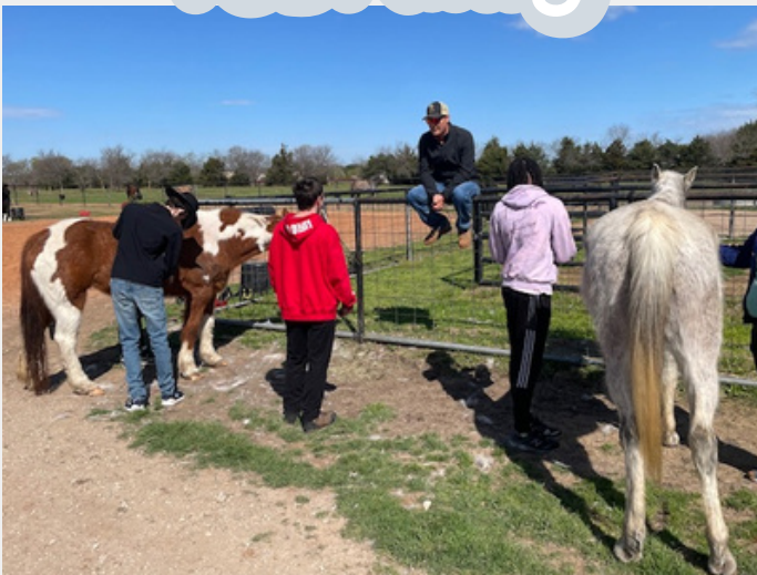
Our teens spent the fun-filled day at Gamilah Unbridled, learning about the power of liberty and how it can change a rescued horse's life. They embarked on a journey of empathy, connection, and growth. These teens learn the fundamentals of equine care and horsemanship and cultivate a profound sense of responsibility and compassion. Without a doubt, we have natural cowpokes in our group!